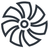
EC EXHAUST FAN