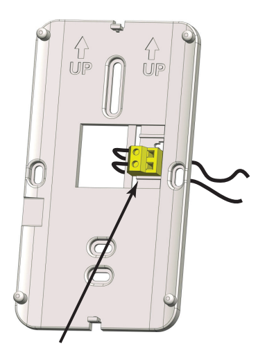
Twin core cable from heater to wall bracket teminals