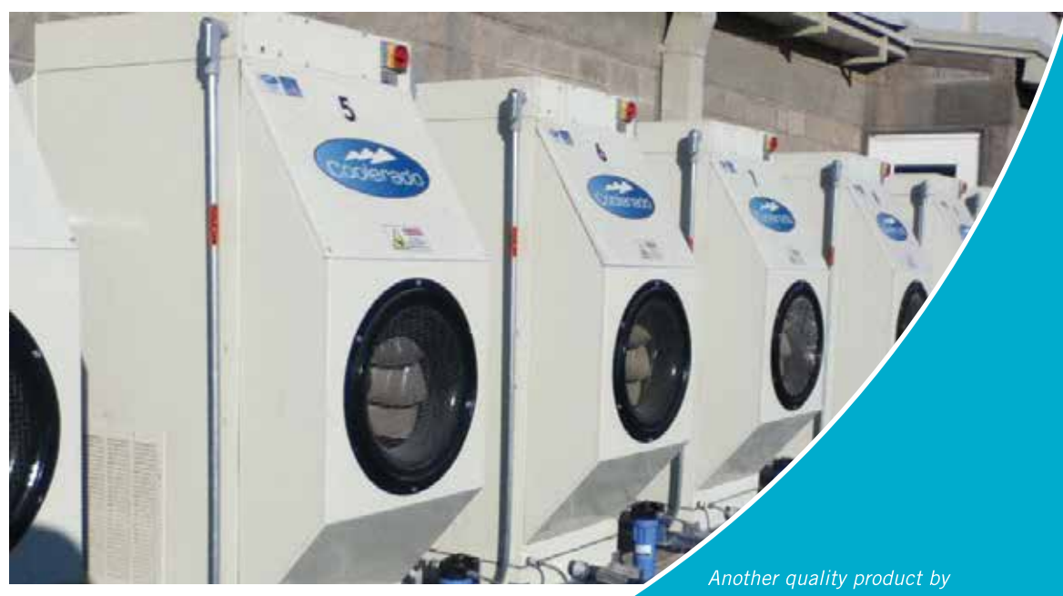
Kellogg's Food Processing Plant at Mexicali, Mexico

The application – a processing plant at sea level elevation, was determined to need 50 tons of cooling. If Kellogg's opted to cool with traditional methods, they would consume roughly 60kW during peak cooling conditions.