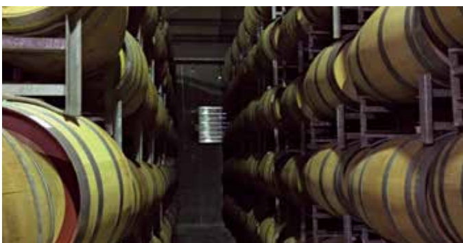
Food and Beverage Manufacturing