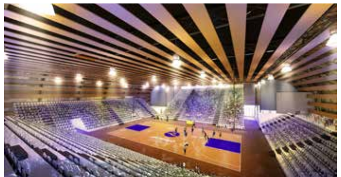
Leisure and Sporting Facilities