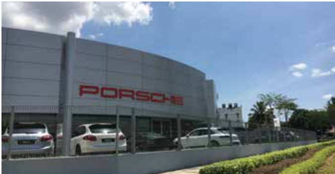
Retail Showrooms and Supermarkets